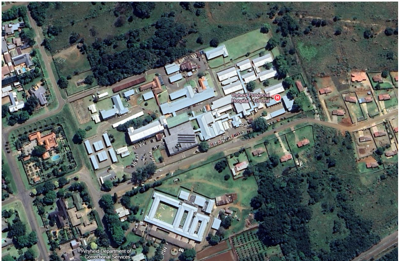
Figure 2: Vryheid Hospital Precinct