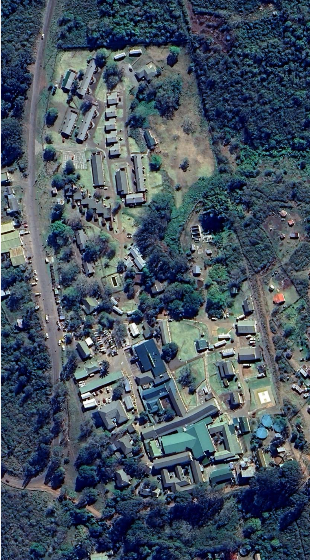
Figure 3: Bethesda Hospital Precinct